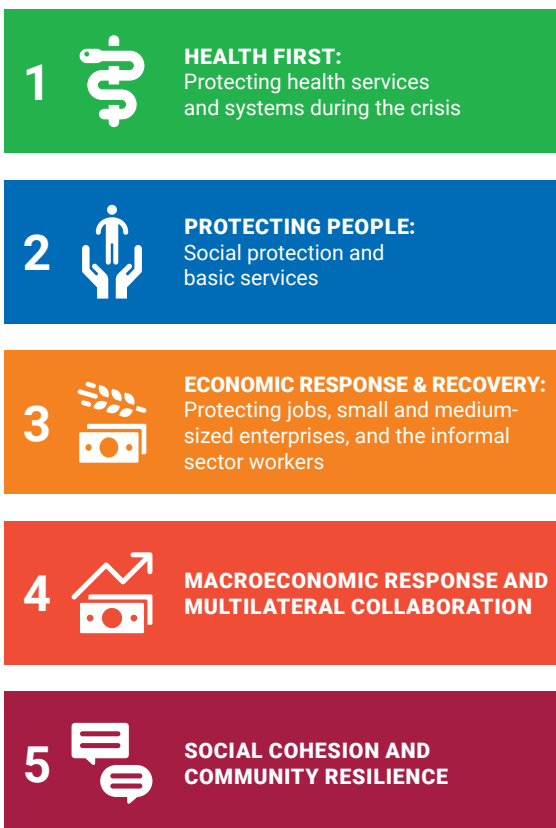
CHART 1: FIVE PILLARS OF THE UNDS RESPONSE